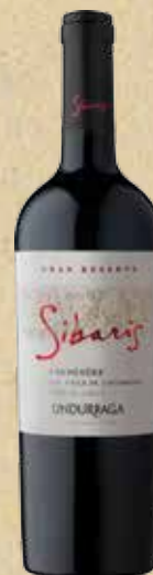
CARMENERRE GRAN RESERVA «SIBARIS» / UNDURRAGA