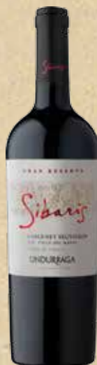
CABERNET SAUVIGNON GRAN RESERVA «SIBARIS» / UNDURRAGA