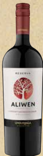
CABERNET SAUVIGNON-SYRAH RESERVA «ALIWEN» / UNDURRAGA