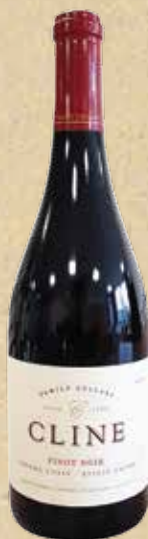
PINOT NOIR / CLINE