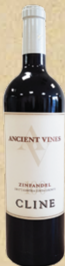
ZINFANDEL ANCIENT VINES / CLINE