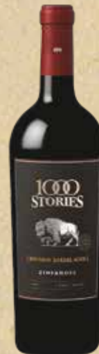
ZINFANDEL 1000 STORIES / FETZER