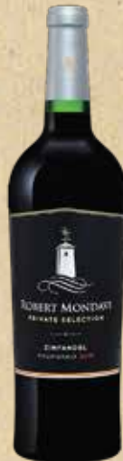
ZINFANDEL PRIVATE SELECTION / ROBERT MONDAVI