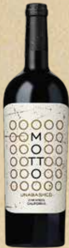
ZINFANDEL UNABASHED / MOTTO